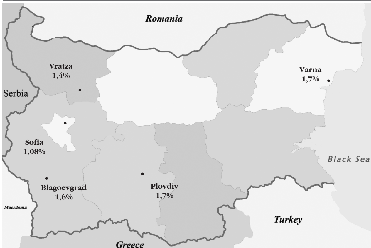
Figure 1: Map of Bulgaria showing prevalence of the cryptorchidism in the different regions.

residing in five regions of Bulgaria (Sofia-city, Plovdiv-city and the adjacent rural area, Varna-city and the adjacent rural area, Blagoevgrad-town and the adjacent rural area, and Vratza-town and the adjacent rural area) were included in this population-based cross-sectional study (Figure 1). Sofia-city is the capital of Bulgaria with an approximate population of 1,376,000. Varna and Plovdiv are the largest Bulgarian towns with populations of about 350,000 each, while Blagoevgrad and Vratza are smaller towns with populations of around 70,000 citizens each. The total population of the country is about 8 millions. The areas and towns were chosen at random and they are representative for the country's population and structure. Altitudes of the respective towns and villages were also recorded. Consent was obtained from all boys and/or their parents for the examination. The study was approved by the Institutional Review